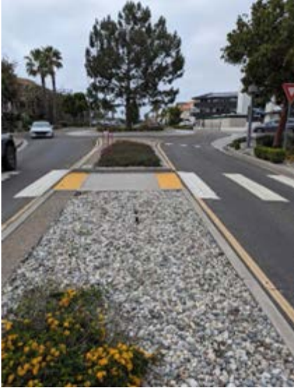
Potential location south of Colima