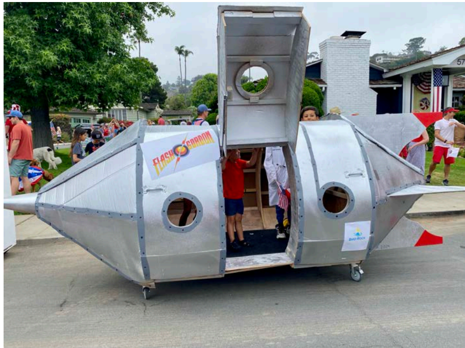
Bird Rock Community Council's "Flash Gordon" rocket ship

a Bird Rock Neighborhood Tradition (2024 theme "Super Heroes and Everyday Heroes")