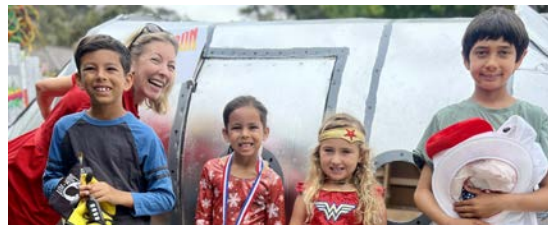
"Flash Gordon" rocket ship crew members