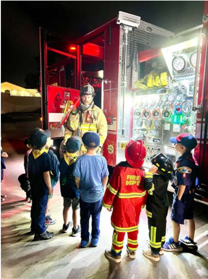
Kindergarten aged Lions visiting the Fire Station in La Jolla.