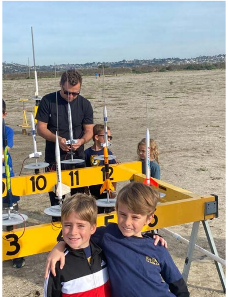
Scouts attending a model rocket launch