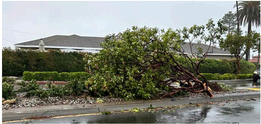
Bird Rock MAD median Arbutus tree felled during 3/1-3/2 overnight traffic accident just south of the Camino de la Costa roundabout.