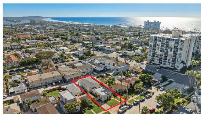
Pacific Beach Investment Property 1027-1033 Wilbur Ave | $3,695,000 | 7 Units