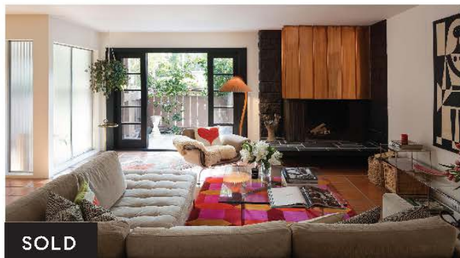
Mid Century Modern Gem 2616 Torrey Pines D17 | $875,000 | 2BD/2BA

Buy or sell with me in 2024 and 10% of my commission will be donated to a school or charity of your choice upon request.