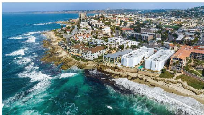
La Jolla Ocean Front Complex 100 Coast Blvd #308 | $4,800,000 | 3BD/2BA