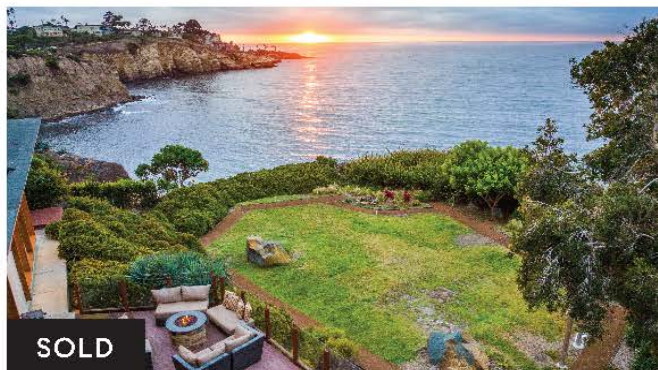
Panoramic Ocean Views 1720 Torrey Pines Rd | $11,000,000 | 3+BD/3BA