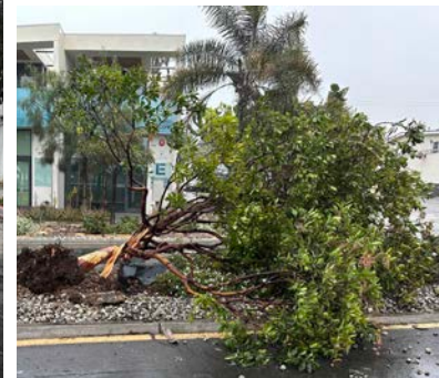
The tree will be replaced in the future.