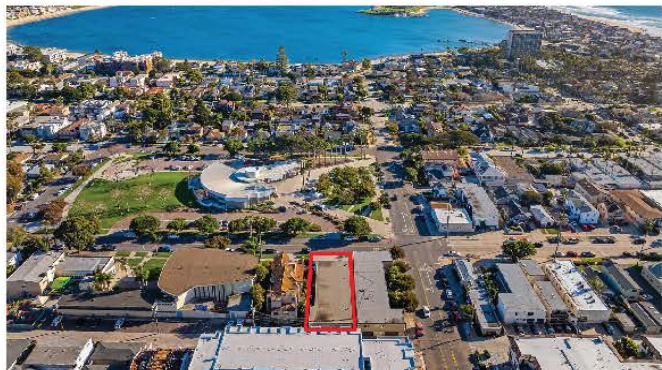
Pacific Beach Investment Property 1012 Thomas Ave | $5,295,000 | 9 Units