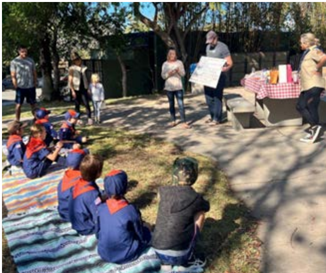
↓ Scout activities ↓