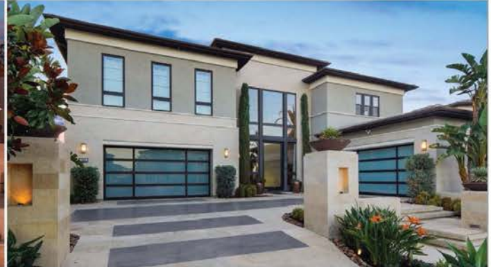
6166 LEMONGLAZE CT. SAN DIEGO, CA 92130 $5,275,000