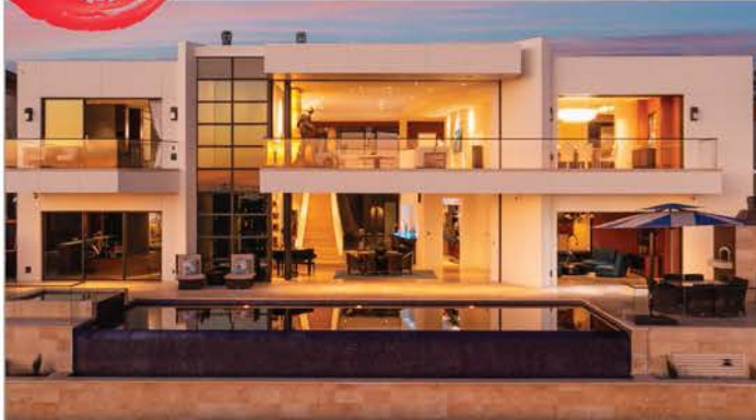
1301 DOLPHIN TERRACE CORONA DEL MAR, CA 92625 $19,500,000