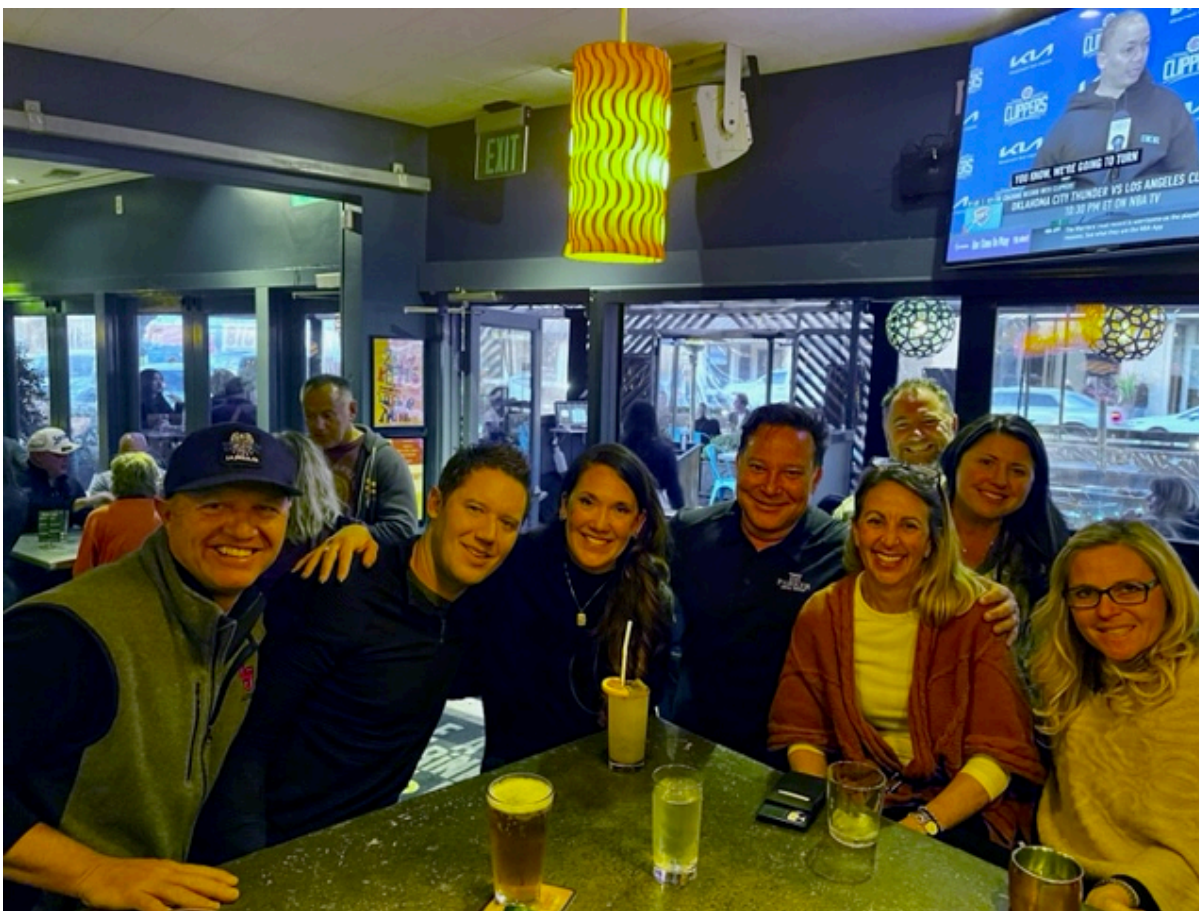
March 23 Bird Rock Happy Hour at Beaumont's