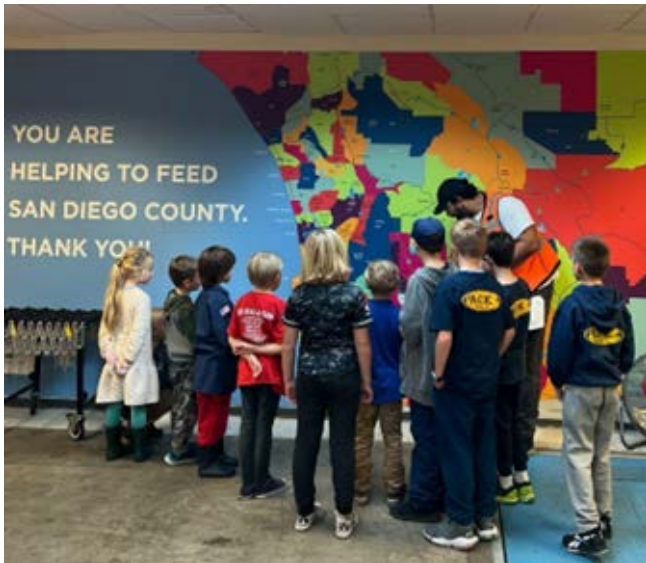
↑ Feeding San Diego