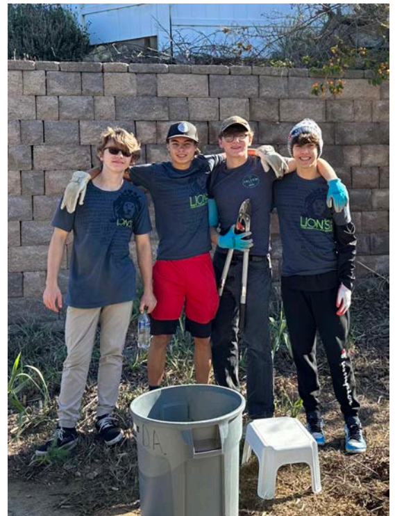
Lion's Heart bike path clean-up volunteers