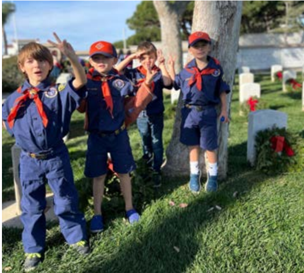
↑ Wreaths Across America

Cub Scouts make a difference in our community along with having fun and building friendships.