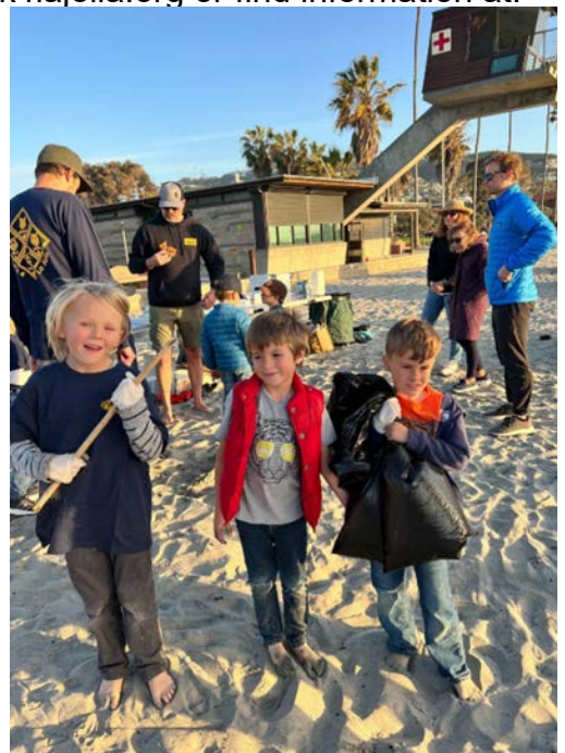
Beach Clean Up ↑

If you are interested in joining or to learn more about La Jolla's Pack 4 Scouts, you can email to LaJollaPack004@pack4lajolla.org or find information at: www.pack4lajolla.org .