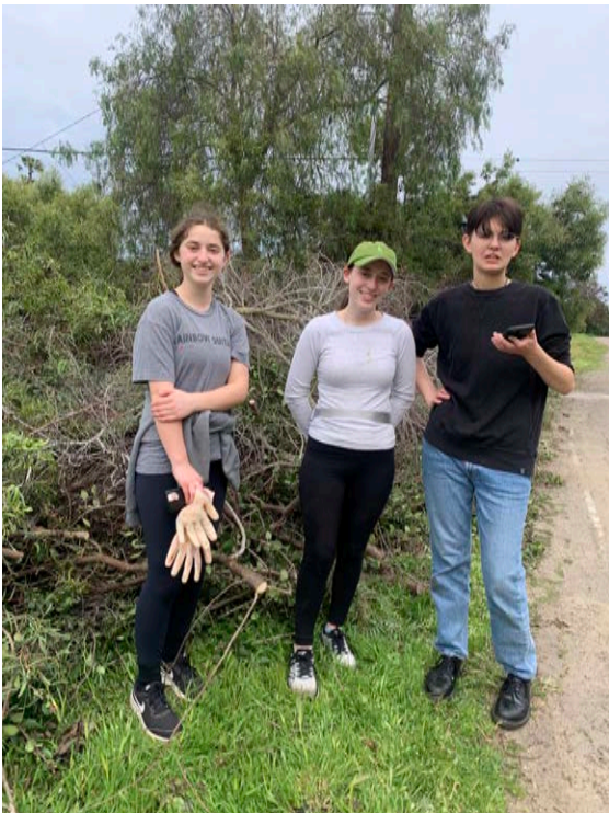
La Jolla Key Club bike path clean-up volunteers