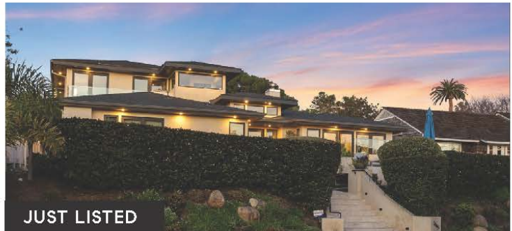
JUST LISTED 5845 Camino De La Costa | $6,000,000