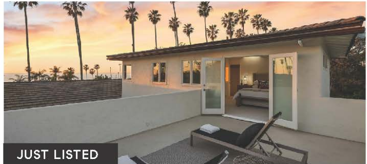
JUST LISTED 6423 Avenida Cresta | $4,968,000