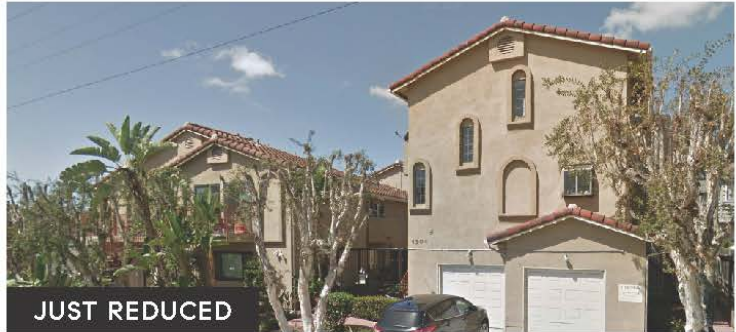
JUST REDUCED 4504 60th Ave Unit 5 | $424,000