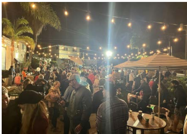
BirdStock crowds gather outside Bird Rock Surf Shop for a concert

The Bird Rock Community Council with volunteer support from the Bird Rock Foundation planned a highly successful block party style event on La Jolla Boulevard between Midway St. and Camino de la Costa. Hundreds of people participated in the day-long event. Proceeds generated through donations, the sale of vendor booth space, and a portion of sales from businesses benefited the Bird Rock Foundation, which supports the Bird Rock Elementary School.