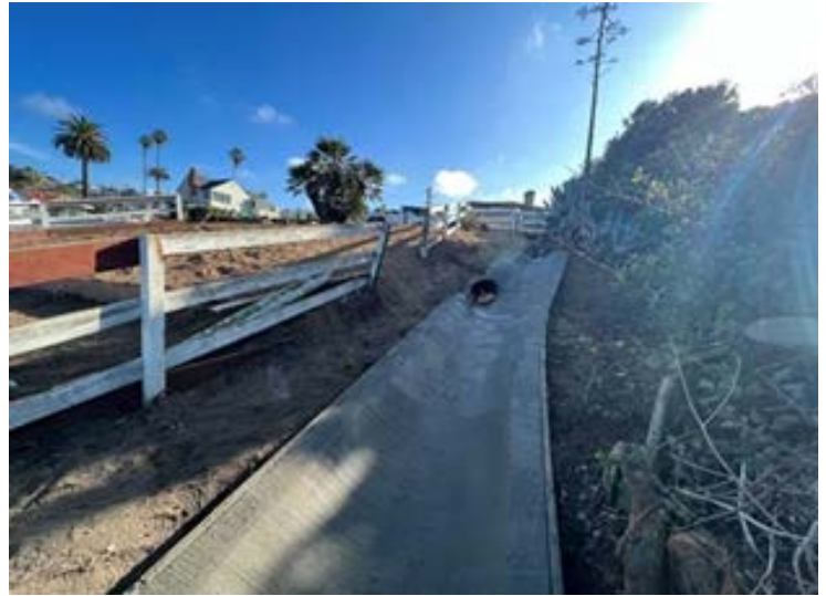
Brown ditch (culvert) looking upstream after concrete work