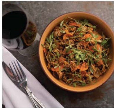
ASSENTI'S ORECCHIETTE PASTA