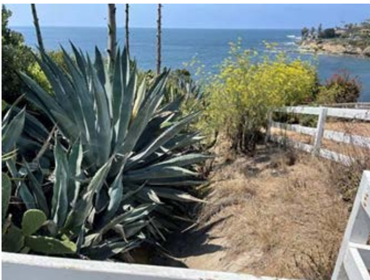
Culvert BEFORE Clearing and Cleaning

Additional clean up, repair work, and erosion control was performed by the City Park and Recreation Dept. Remaining to be completed are the repair of the stairway access to the southwest corner viewing area, return of the viewing bench, further erosion prevention or control, and additional and regularly scheduled vegetation trimming to restore and maintain the wonderful views.