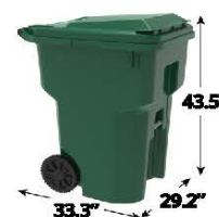
95 Gallon Container