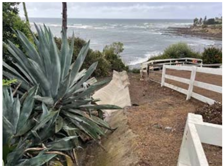
Culvert AFTER Clearing and Cleaning