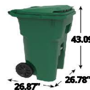
65 Gallon Container