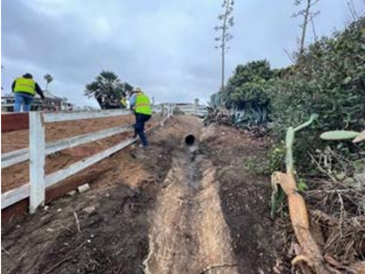
Brow ditch (culvert) looking upstream, after cleaning and before concrete work