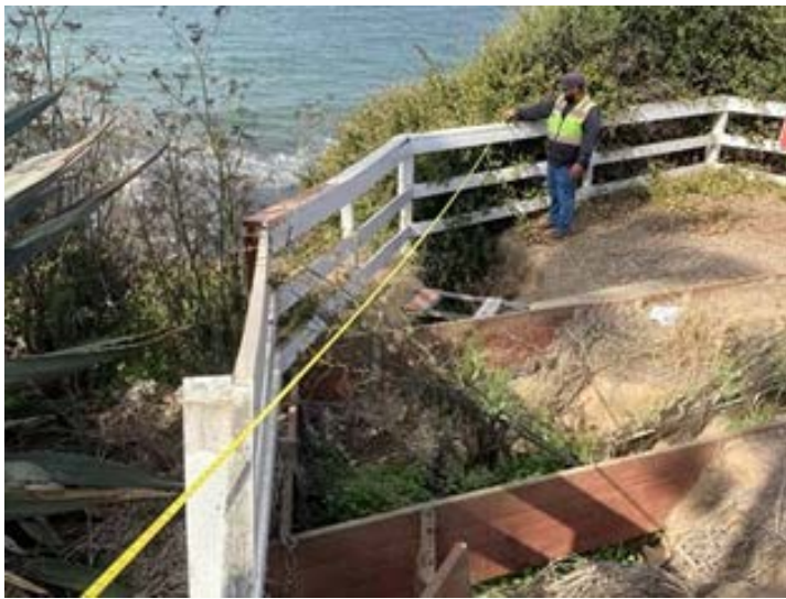
Adjacent storm water culvert