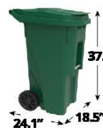
35 Gallon Container