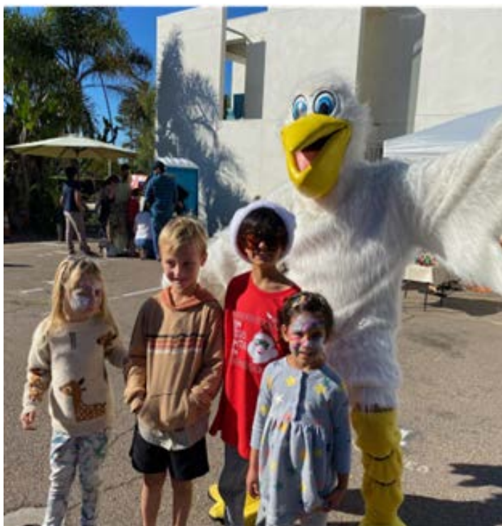
Visitors with Rocky, BRE's mascot