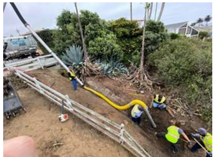
Crews Cleaning Ditch