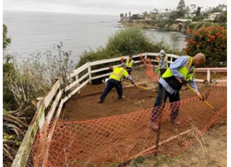
Damaged area after repairs