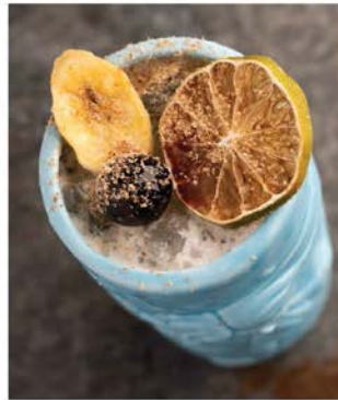
TIKI T'S WIND & SEA