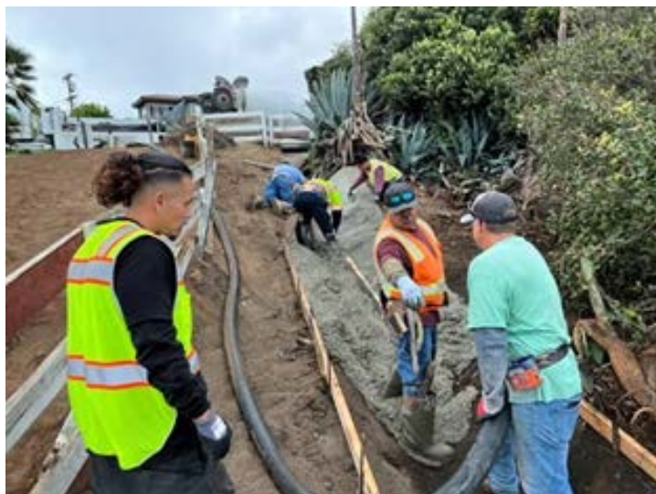
Crews placing concrete