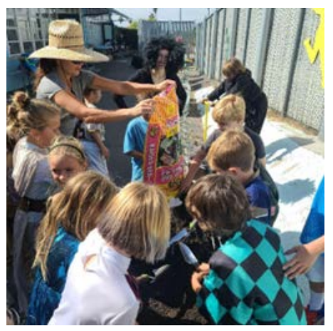
BRE 2nd grade students

On Halloween day, 2nd grade classes prepped their tubs and planted seeds (some combinations of chard, purple cauliflower, broccoli, bok Choi, spinach, fennel, and/or pole beans). In the next lessons, they will start to talk about companion plants and add some seeds for these companions.