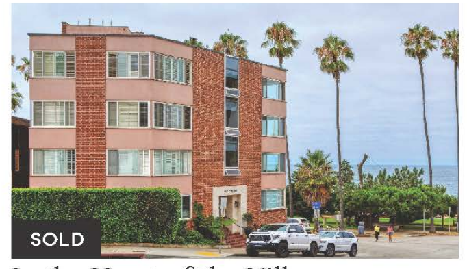
In the Heart of the Village 8040 Girard Ave Unit 1 | $900,000 Represented the Buyer

Buy or sell with me in 2022 - 2023 and 10% of my commission will be donated to a school or charity of your choice upon request.