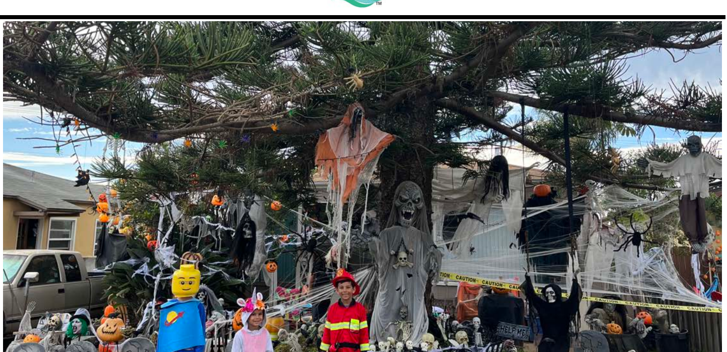
Bird Rock Neighborhood Halloween Decorations