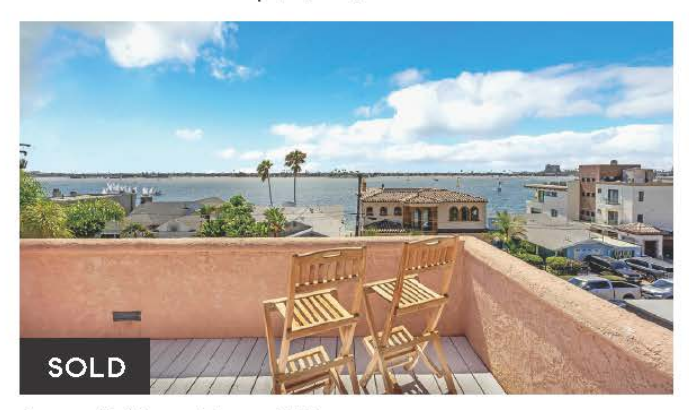
Sparkling Bay Views 3701 Riviers Dr. Unit 11 | $1,617,785