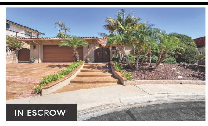
Stunning Bay Views & Lush Landscape 5329 Calle Vista | $2,150,000