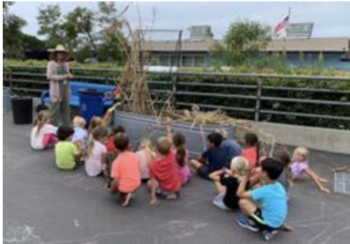
BRE 1st grade students