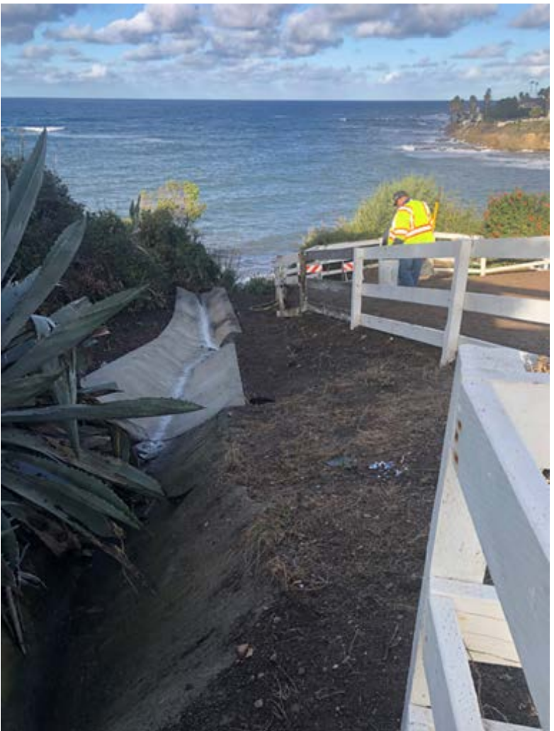
Right photo from 11/9/2022 after removal of debris and plants, repair of slope between culvert and the Park, and addition of a new concrete section towards the bluff edge.

The eroded southwest bluff edge corner of La Jolla Hermosa Park has been partially fixed, although work remains to be done. The lower southwest corner viewing bench was temporarily removed for safety reasons but is scheduled to be returned to its pad after repairs are made. Portions of the Park remain dangerous and are blocked off.