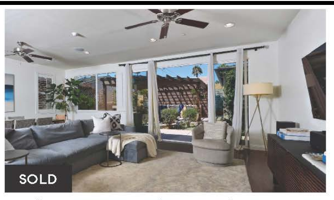
Perfect Home at the Beach 1138 Beryl St | $2,510,000