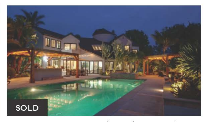
Amazing Home w/ Pool & Gardens 14926 Vista Del Oceano | $4,300,000 Represented the Buyer