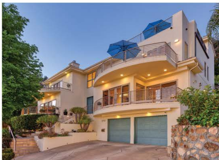
5787 Bellevue Avenue | La Jolla Offered at $5,250,000