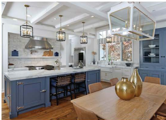
1431 Rodeo Drive | La Jolla Offered at $7,495,000